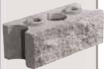
AB Dublin center-split block