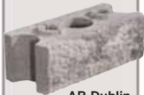
AB Dublin end-split block

The first and the last block of every course of wall panel will be a split block. Using a split block allows the panel to be flush with the post. If a standard angled block shape is used there will be a gap where the panel meets up with the post. Use a AB Dublin end-split block to start the first course. Place the short piece with the split side against the post in the center of the post. Save the other half for the end of this course where it meets up with the next post. Place the next block of the first course against the split block. We recommend installing the first two courses of the wall panel at the same time to ensure proper alignment.