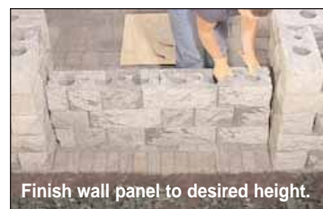
Finish wall panel to desired height.