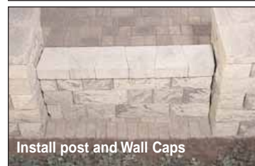
Install post and Wall Caps