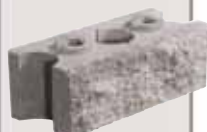
AB Dublin Block